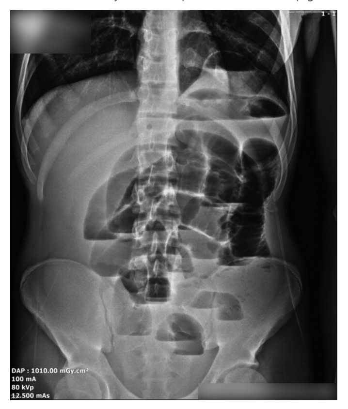
Figure 1. Multiple broad-based air-fluid levels and herniated bowel loops in abdominal X-ray

At admission, the patient described repeated bouts of increasing abdominal pain and recent bilious vomiting. He was unable to pass stool for the past 24 h. Thoracic examinations revealed equal lung sounds in both hemithoraces and no bowel sounds in the thorax. Abdominal examinations indicated distention, generalized tenderness, and guarding. Laboratory tests revealed an elevated C-reactive protein level and white blood cell count. Blood biochemistry tests were normal. Urinalysis was negative for protein, occult blood, and leukocytes. A prominent air-fluid level in the abdominal X-rays and a suspicious bowel loop in the thorax at the level of the left diaphragm in posteroanterior chest X-rays were observed (Figure 1). Abdominal ultrasound results were normal. He underwent thoracic and abdominal computed tomography (CT) for a definitive diagnosis. The CT showed air-fluid levels in the left hemithorax and distended distal bowel segments in the abdominal cavity that is compatible with the ileus (Figures