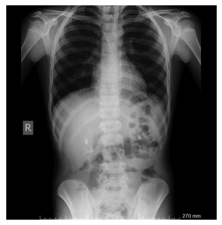
Figure 1. Plain radiograph shows diffuse air - fluid levels

Pathological examination was consistent with AA and also bleeding on the tip of the appendix was noted. The patient healed completely without complication and was discharged three days after operation.